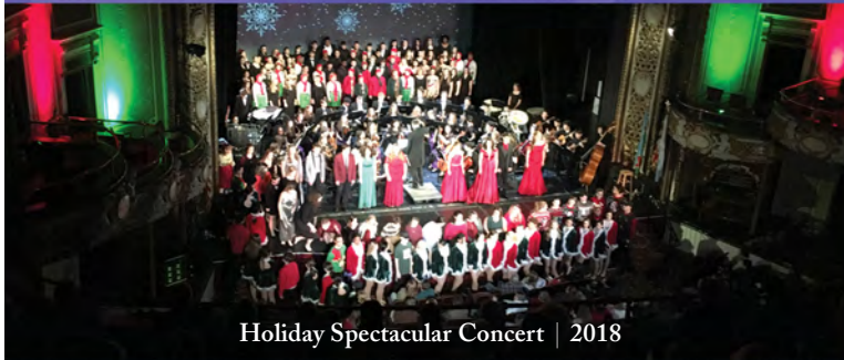
Holiday Spectacular Concert | 2018

for investing in the next generation of artists. We look forward to sharing our talents with you and the community throughout the school year.