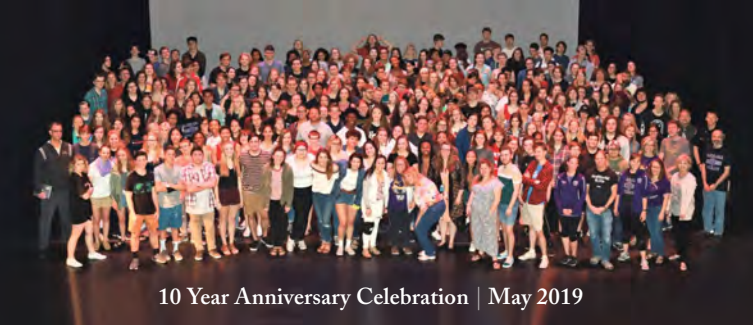
10 Year Anniversary Celebration | May 2019