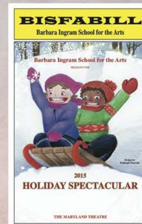
HOLIDAY SPECTACULAR December 21, 2016