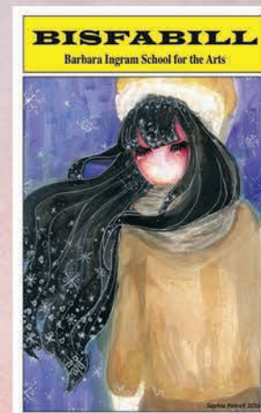
HOLIDAY SPECTACULAR December 20, 2017